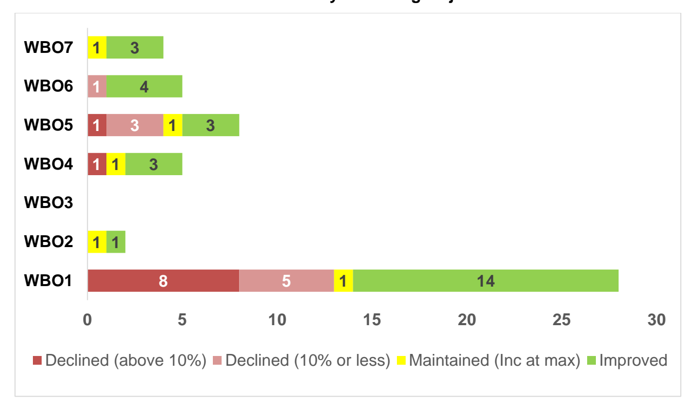
Chart 3 – Performance Indicator Trend by Wellbeing Objective